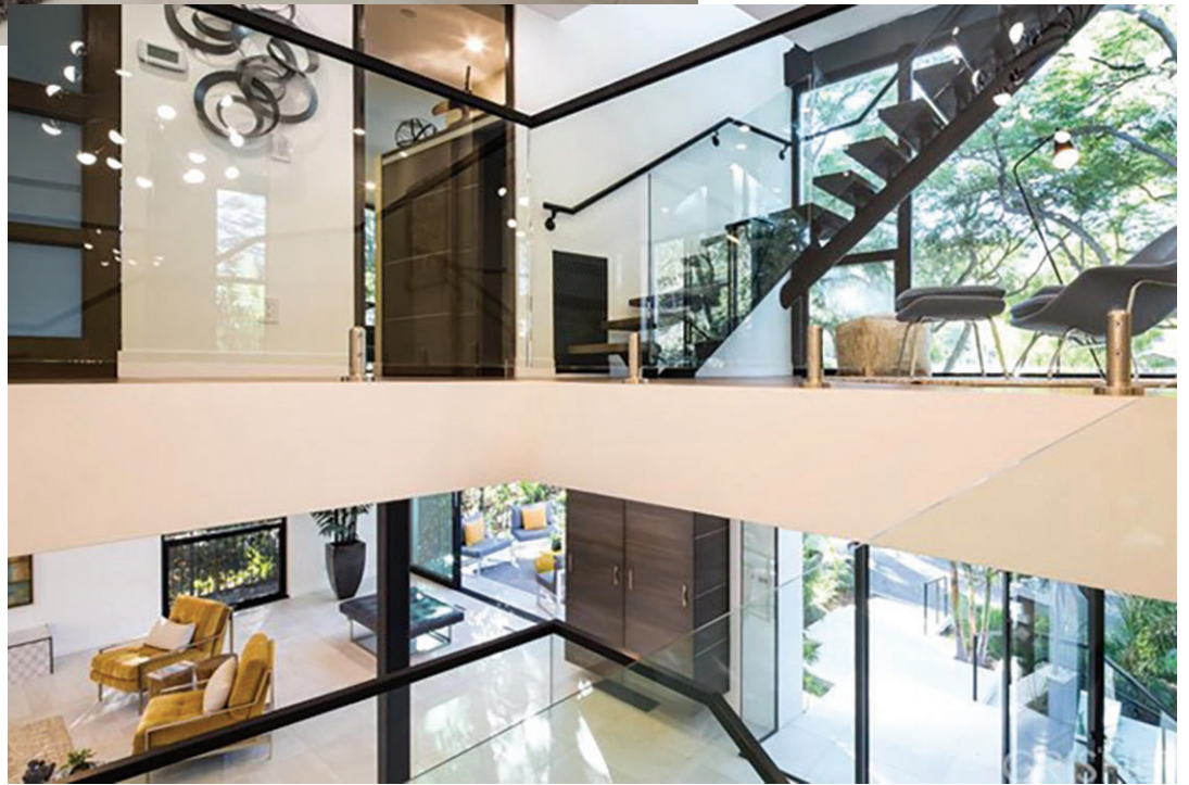
A multi-level view illustrates the numerous glass walls. Bulky ducts would not have worked for this architectural design.