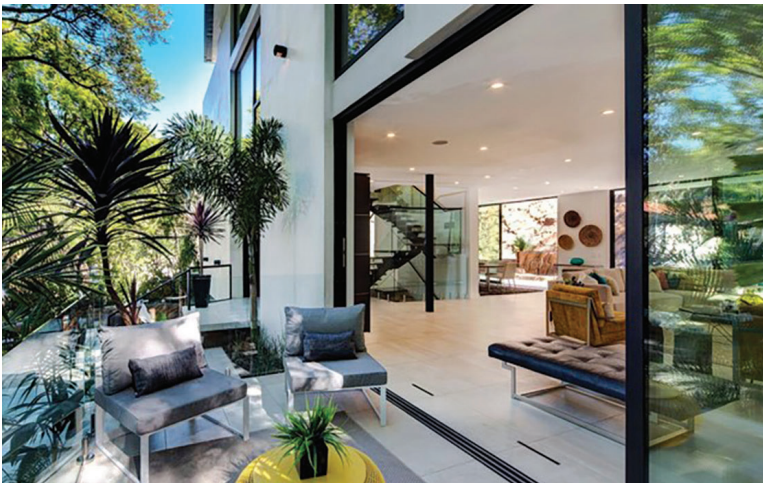
Custom-designed slotted heating and cooling vents are positioned on the floor, just inside the sliding doors.