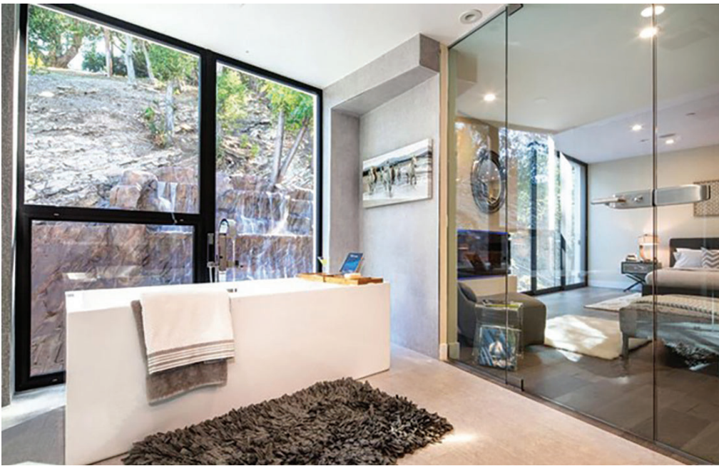
The master bath flows seamlessly into the bedroom thanks to full-wall glass doors. A Unico outlet quietly delivers air from the ceiling.

around support beams and above ceilings, quietly delivering high-velocity air through either slotted or small round outlets. With this unique type of contemporary design, soffits and dropped ceilings are not a viable option.