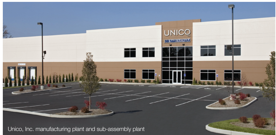
Unico, Inc. manufacturing plant and sub-assembly plant

Unico, Inc. 1120 Intagliata Drive Arnold, MO 63010 +1 800 527 0896 +1 314 481 9000 www.unicosystem.com