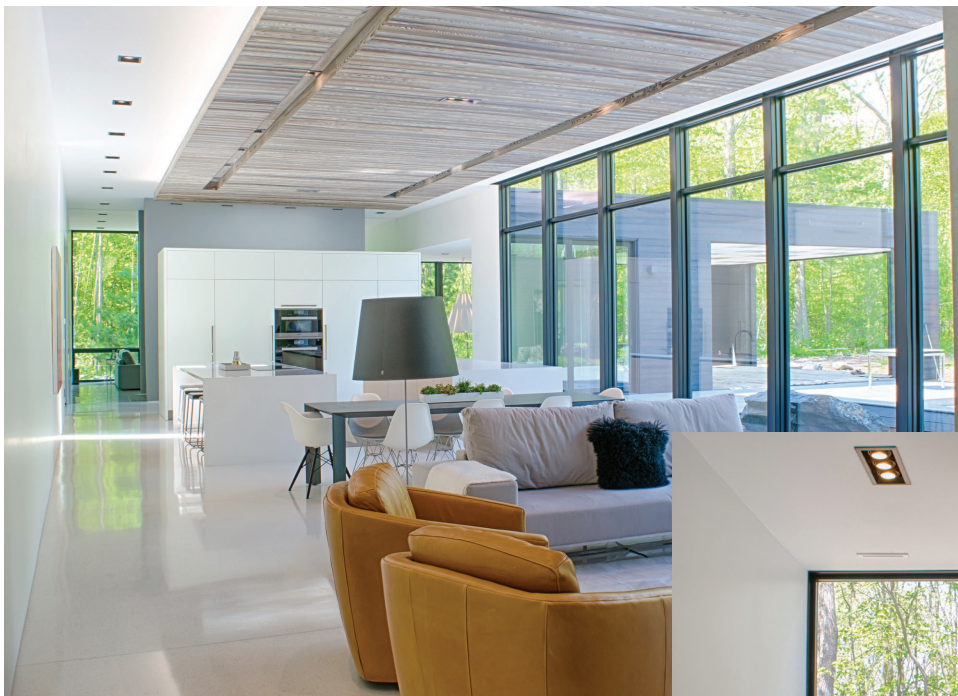
Unico matches the modern, open design of the living room.