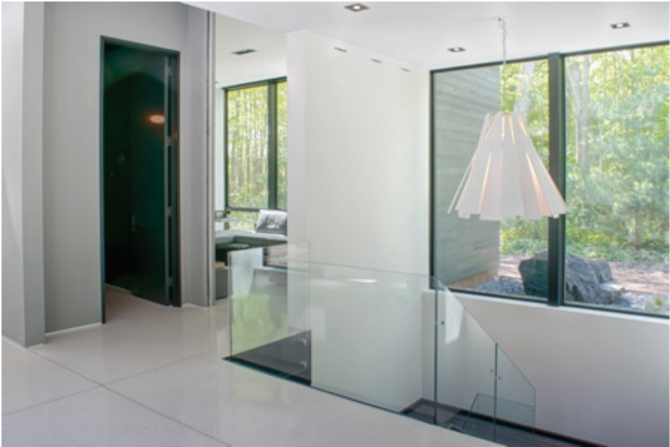
Modern elegance and superior indoor comfort blend together in the Woodland House.