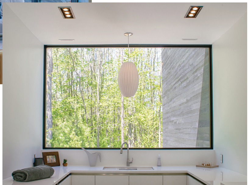
The laundry room features a woodland view.