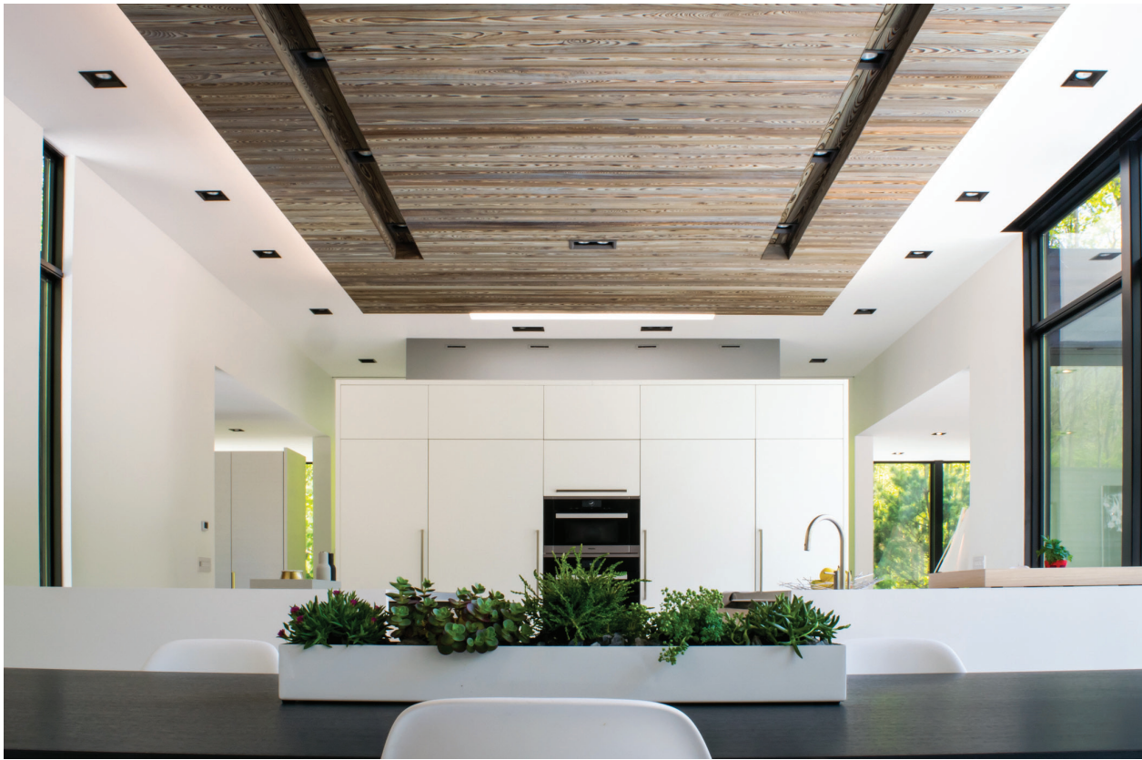
Unico slotted outlets match the sleek, linear design of the Woodland House kitchen.