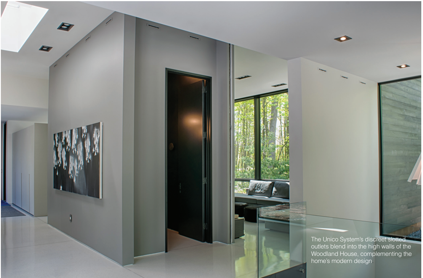
The Unico System's discreet slotted outlets blend into the high walls of the Woodland House, complementing the home's modern design.

of modern living.” The two-story home features 6 bedrooms, 8 bathrooms, floor-to-ceiling windows, a balance of indoor and outdoor living spaces, motorized retractable screens, environmentally responsible materials and, of course, top-of-the-line Kohler bath and kitchen fixtures and accessories.