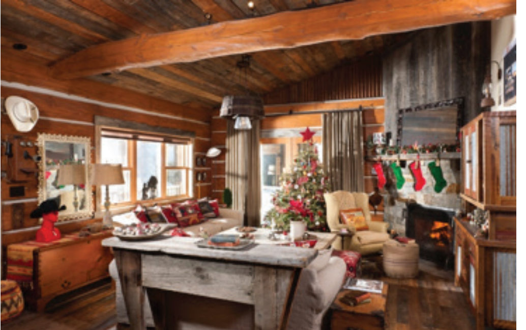
The Unico System's unobtrusive round outlets blend into the ceiling. While wood outlets are available and can be stained to match any wood type, the Valentiner's decided that dark brown outlets would better contrast and highlight the reclaimed barn wood of the ceiling.