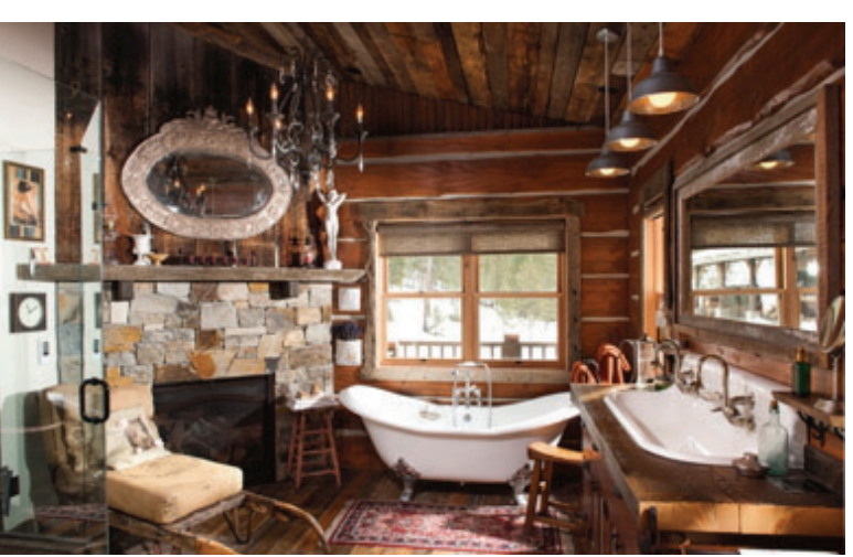
The master bathroom features its own fireplace, period claw-foot bathtub and discreet central heating and cooling with The Unico System.