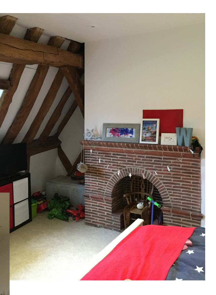
The Unico System fits where others can't and preserves the integrity of historic homes and structures.