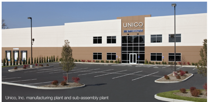
Unico, Inc. manufacturing plant and sub-assembly plant

Unico, Inc. 1120 Intagliata Drive Arnold, MO 63010 +1 800 527 0896 +1 314 481 9000 www.unicosystem.com