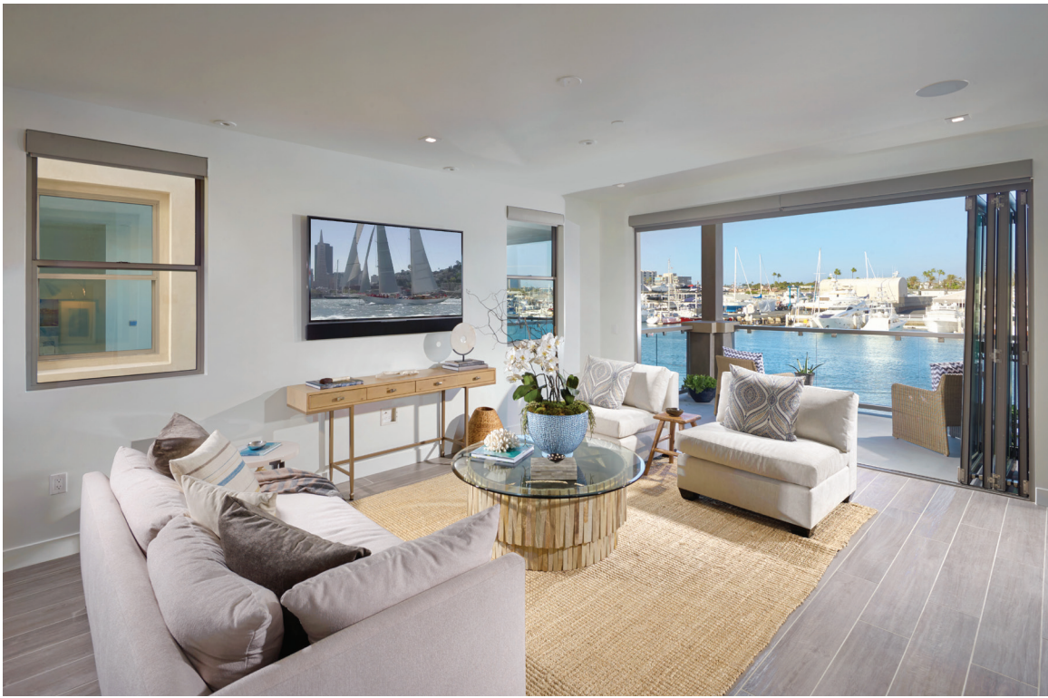
The Unico System's discrete round outlets blend into the ceiling of a VUE Newport living unit and do not detract from the beautiful harbor view.

amenities and creature comforts. VUE Newport puts its own spin on the “live, work, play” model with its motto of “Live. Dock. Dine. Shop.”