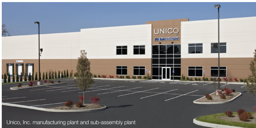
Unico, Inc. manufacturing plant and sub-assembly plant

Unico, Inc. 1120 Intagliata Drive Arnold, MO 63010 +1 800 527 0896 +1 314 481 9000 www.unicosystem.com