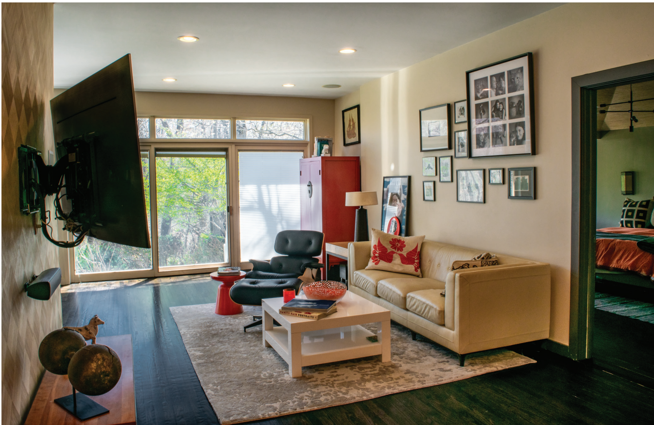
Can you find The Unico System's discreet outlets in this photo?